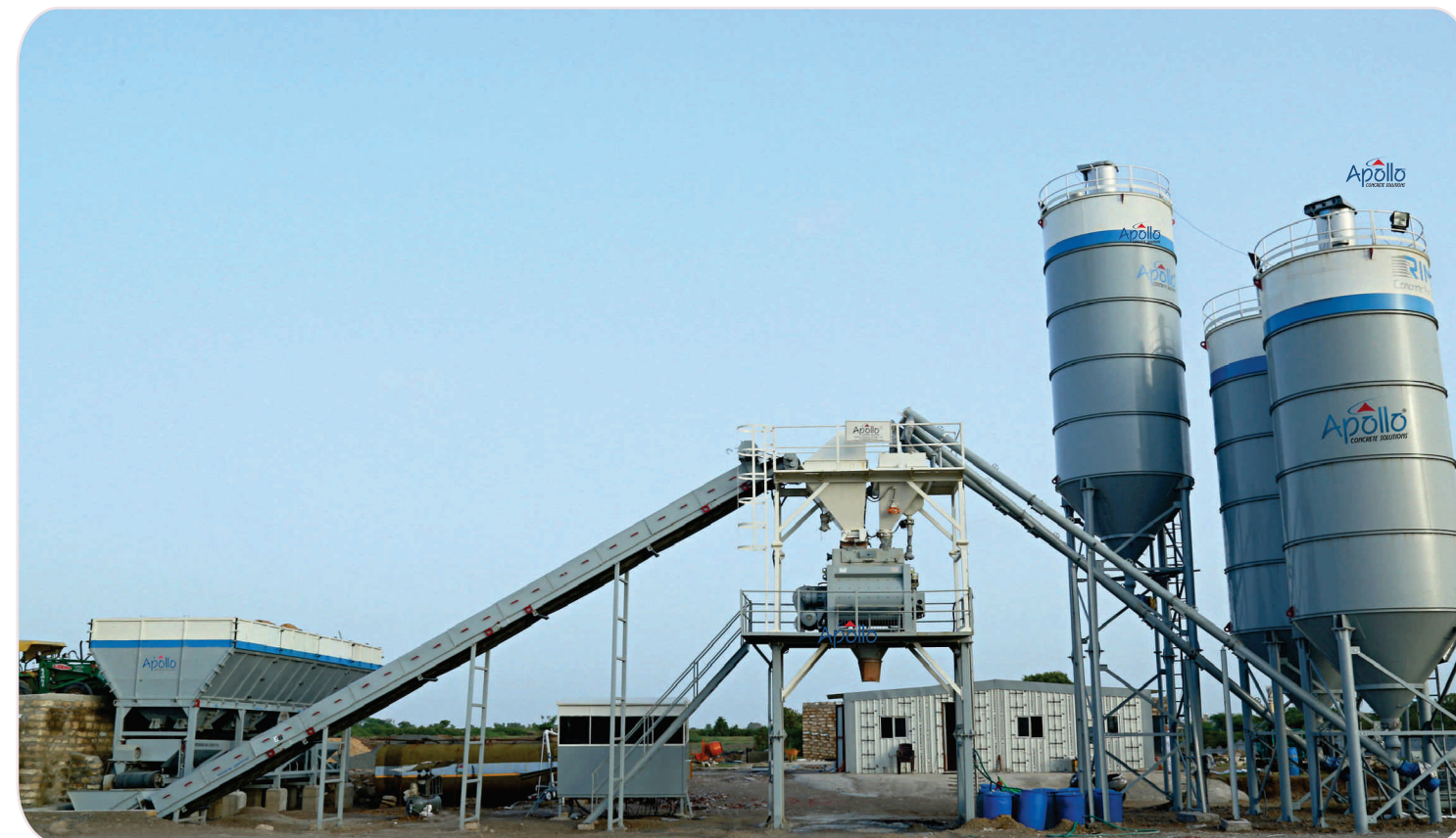
Concrete Batching Plant ATP 45/60/75