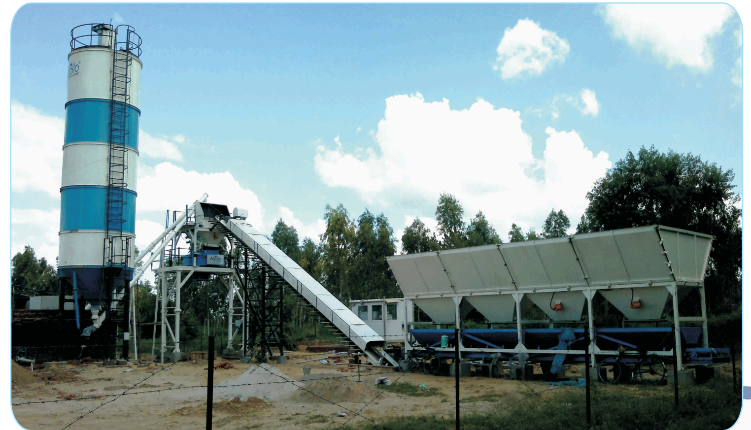
Concrete Batching Plant ATP 30